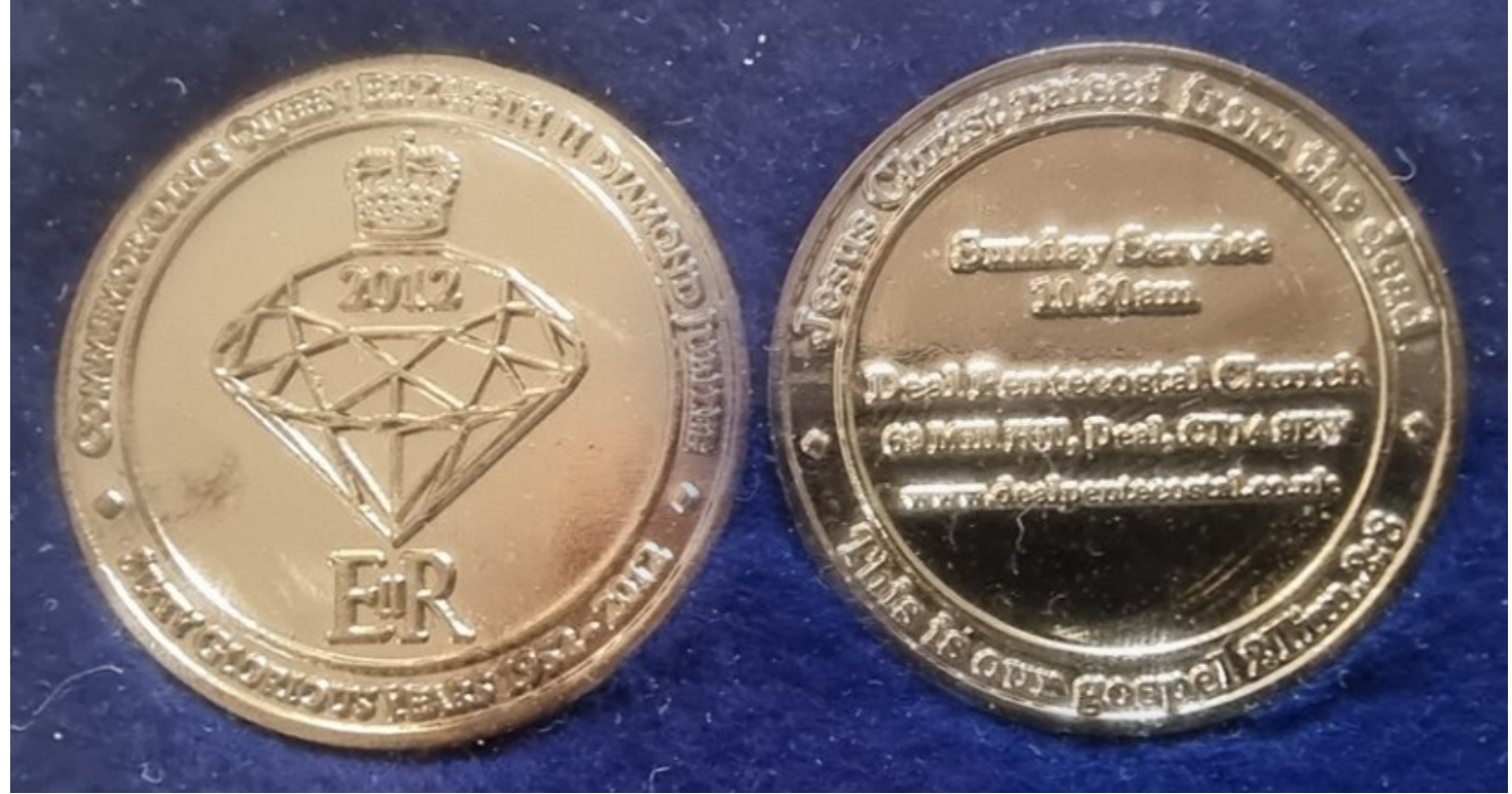
Deal Pentecostal Church Queen's Diamond Jubilee Coin 2012