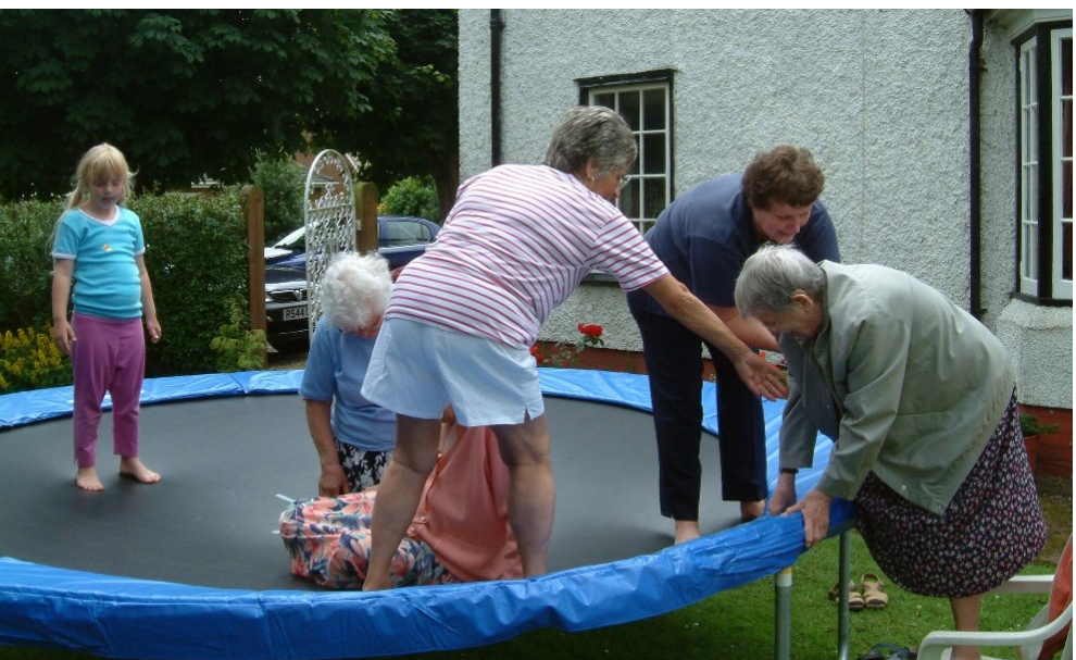
Queen's Jubilee Celebrations 2017