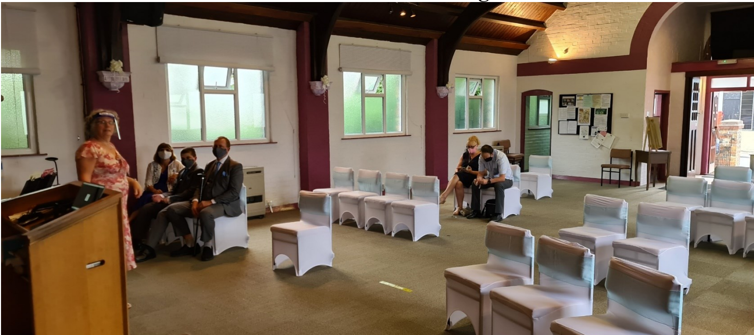
Church Lunch 2021