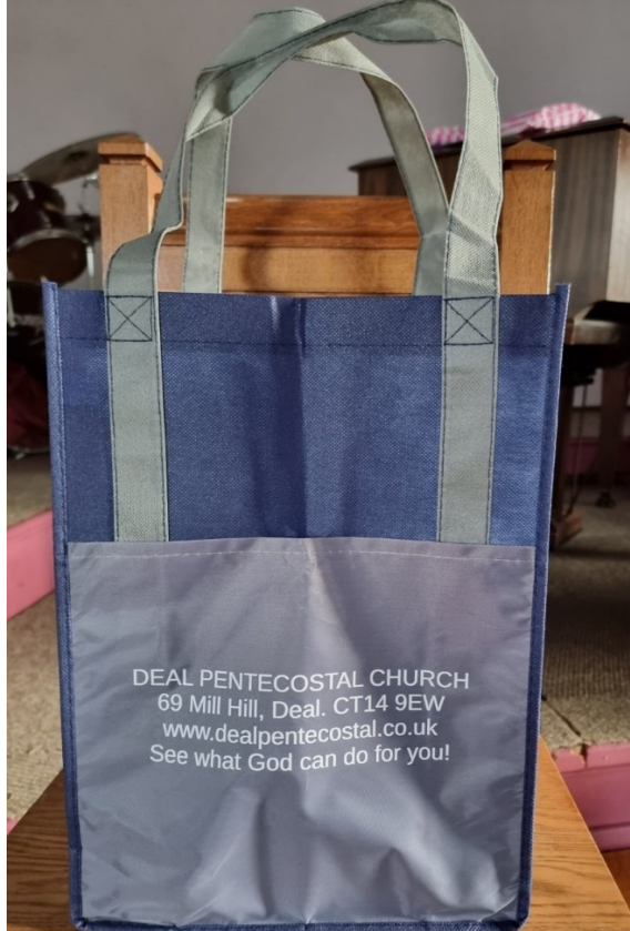
Church Shopping Bags 2021