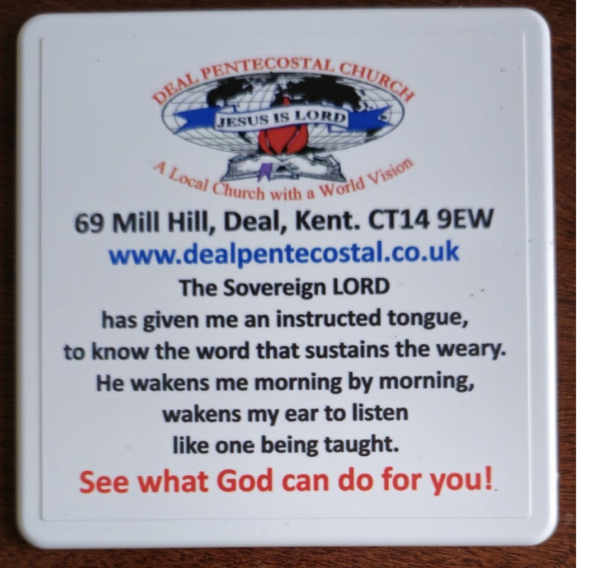
Church Coaster 2023