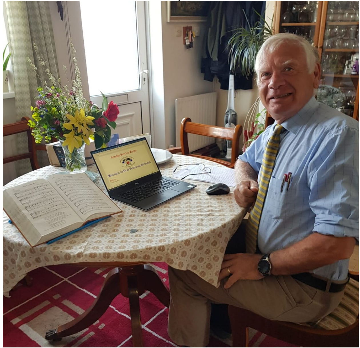
Zoom Screen 2020